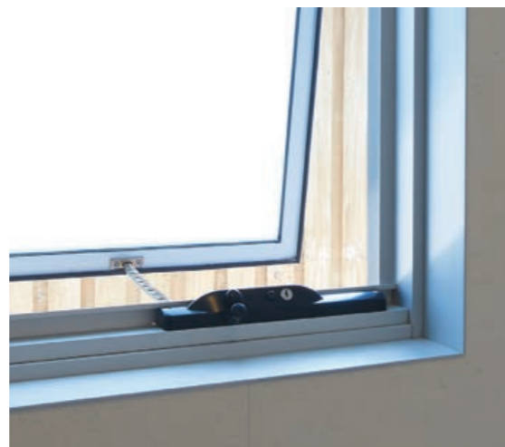
Chain winder with optional sash restriction.